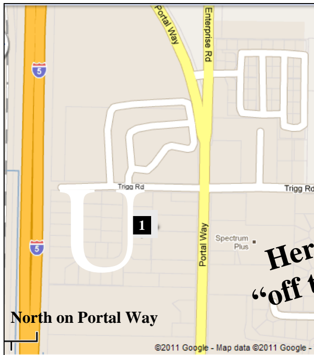
North on Portal Way