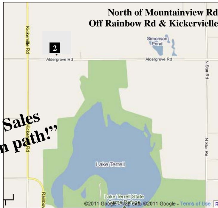
North of Mountainview Rd Off Rainbow Rd & Kickerville

Here are the Sales "off the beaten path!"